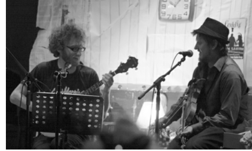
Cloak & Dagger

contributing harmonium when dischord threatened. With curly hair, specs, beards and duffel coats all that was needed was a time machine, a layer of thick smoke and we'd be happily transported